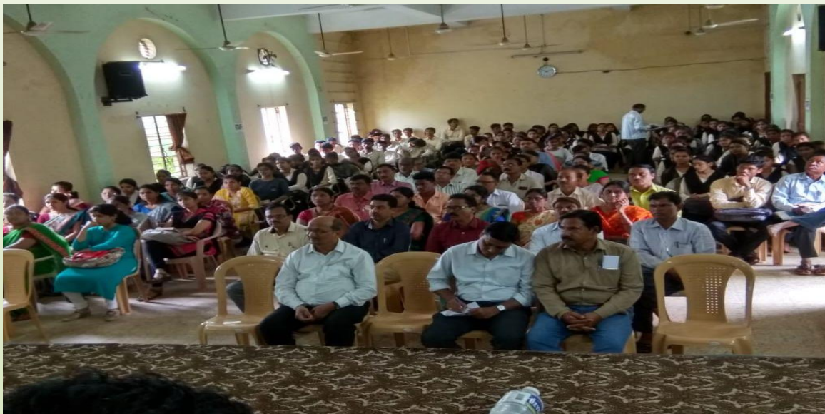
Ist year students, parents and teachers look on